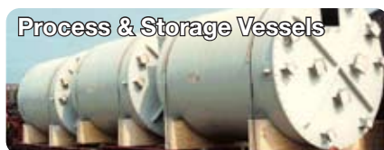
Process & Storage Vessels