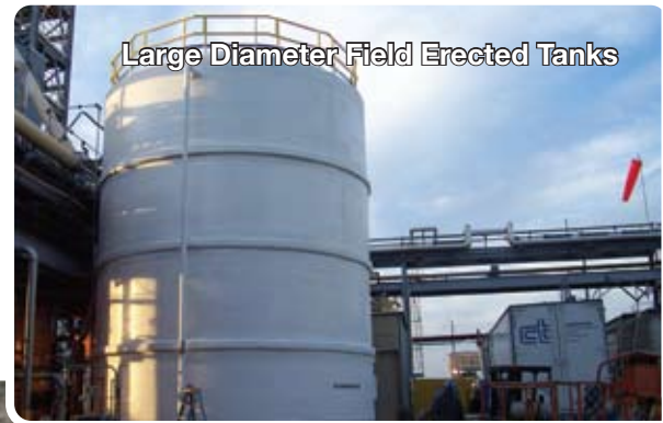
Large Diameter Field Erected Tanks

CoroTech is an experienced group of professionals offering Turn-Key Single Source Solutions solving Corrosion, Pollution Control, and Chemical Process problems worldwide for over 40 years.