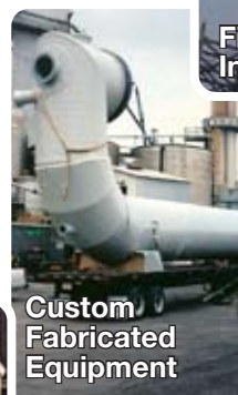
Custom Fabricated Equipment